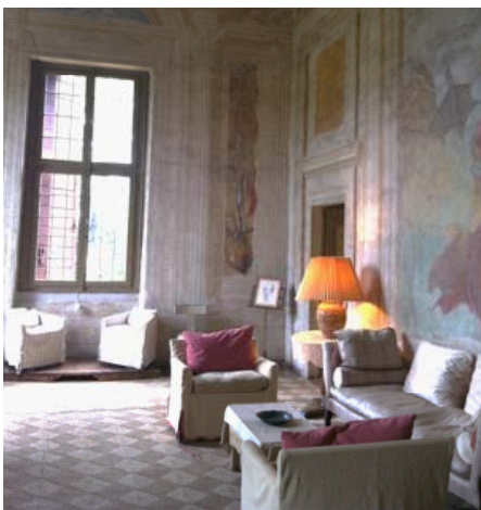
Villa Foscari la Malcontenta