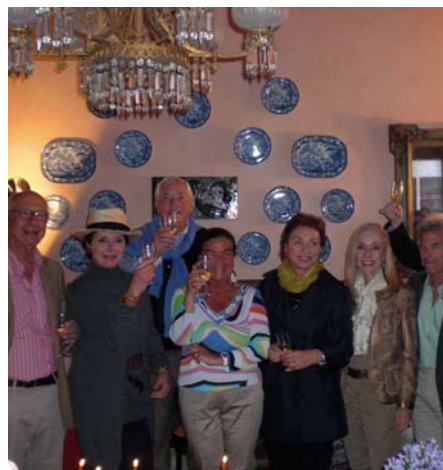
Toasting 10 years of Balbianello Circle Tours