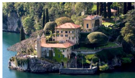
Villa del Balbianello