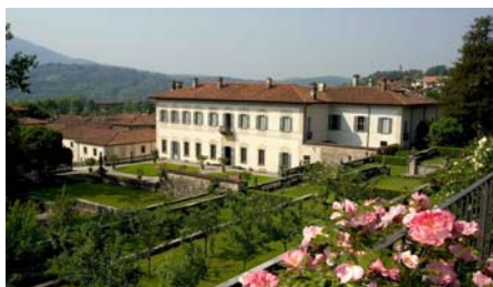
Villa della Porta Bozzolo

c/o Casa Italiana Zerilli-Marimò 24 Wet 12th Street, 5th Fl New York, NY 10011 - Phone 212-242-3377 info@friendsoffai.org - www.friendsoffai.org www.facebook.com/friendsoffai Twitter: Friends_of_FAi